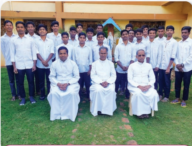
Minor Seminarians with Formators Claret Niketan, Belagavi