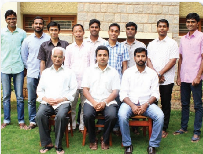
Students with Formators Claretian Seminary Malleswaram